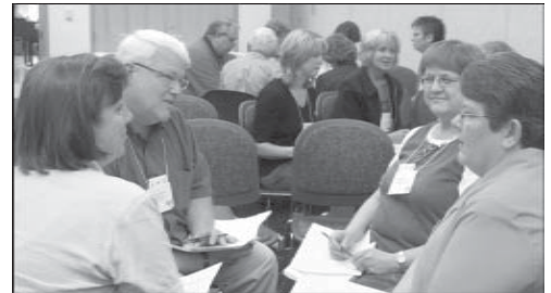
PCC personnel from centers in Flint and Bay City, Michigan, share ideas at the 2006 Summit.

In the last six months, BFL staff has met with board members and administrators of centers in Manistee (MI), Springfield (MO), Angola (IN), and Prescott (AZ). We helped guide them in team and ministry development, equipping them to become more united and effective in the ministry to which God has called them.