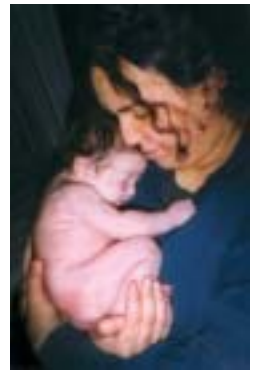
Our 2002 bulletin insert features a PCC client and her new baby.

These items are available through our catalog, which you can view online at www.bfl.org/catalog.htm .