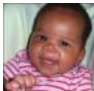
A South African AIDS orphan living in one of the Bethesda Homes.