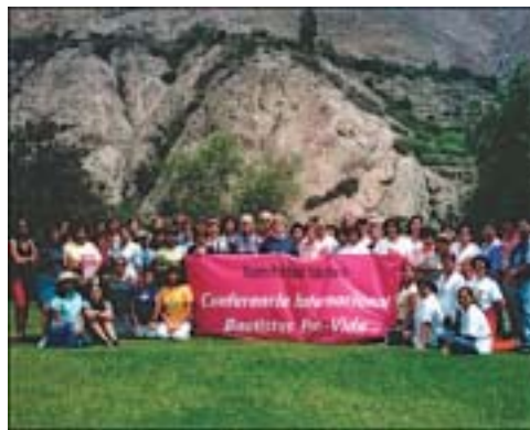
Peruvian centers learn PCC excellence at the international conference.

The threat to centers is by no means over. In February, California abortion activists were invited to learn how to “expose the hidden agendas and activities that take place behind the doors of crisis pregnancy centers,” and also how to take action against them. BFL remains committed to standing alongside centers, helping them constantly improve the level of service they provide.