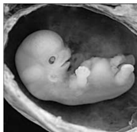
Approximately 6 weeks estimated gestational age from conception; by Lunar caustic, on flickr,